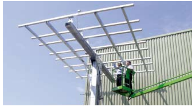
Finite Element Analysis

The Si-Trak is built from high quality galvanized steel which ensures strength and durability in all climates and environments. The focus of the design was efficiency, simplicity, ease of installation and operation. This has resulted in a very cost effective system which requires virtually no setup or initial alignment and can be fully operational in a single day. When fully populated, the Si-Trak PV platform provides a collector area of 50m 2 and using the Si-Con 120X concentrator modules will provide a system that can deliver over 5KW of peak power.